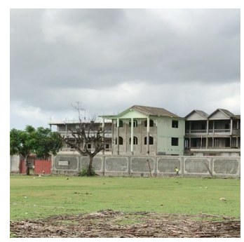
IMR prior to the earthquake