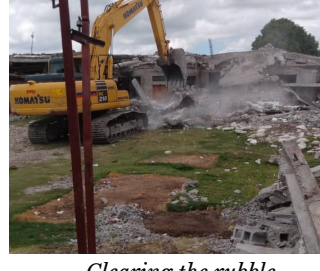
Clearing the rubble