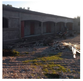
In progress construction